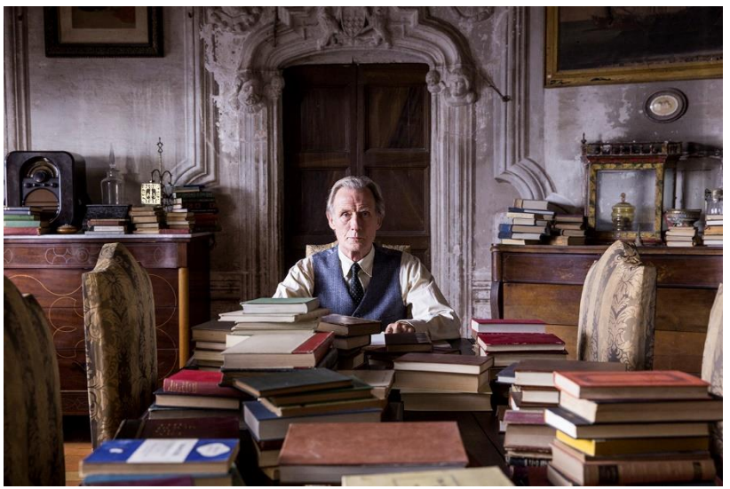
Speelduur: 113 min. - Land: UK - Jaar: 2017 - Genre: Drama Releasedatum bioscoop: 7 juni 2018

THE BOOKSHOP won de 'Prijs voor Beste Boekverfilming van het jaar' op de Frankfurter Bookfair.