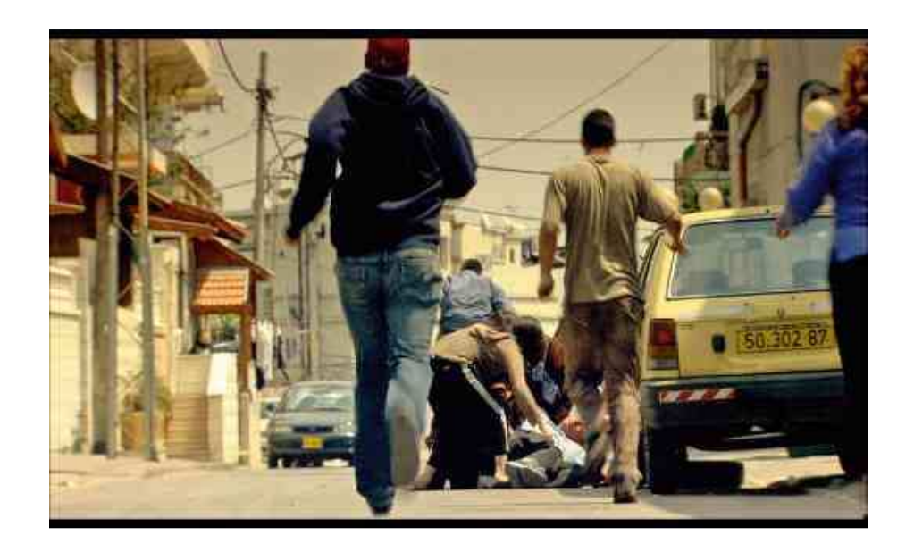
Jaffa's Ajami neighborhood is a melting pot of cultures and con-flicting views among Jews, Muslims and Christians. The tragic fragility of human existence is experienced in the enclosed community of Ajami, where enemies must live as neighbors. No location better expresses the dramatic collision of different worlds. Back and forth in time, and through the eyes of various characters, we witness how impossible the situation actually is .