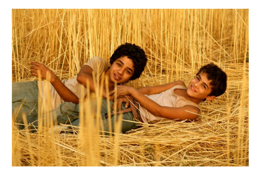
Land: Zweden, Finland, Irak – Jaar: 2012 – Genre: drama – Speelduur: 93 min. Releasedatum: 11 juli 2013 Distributie: Cinéart

The feature film BEKAS won the pitch contest Nordic Talent, arranged by Nordic Film & TV fund in September 2010.