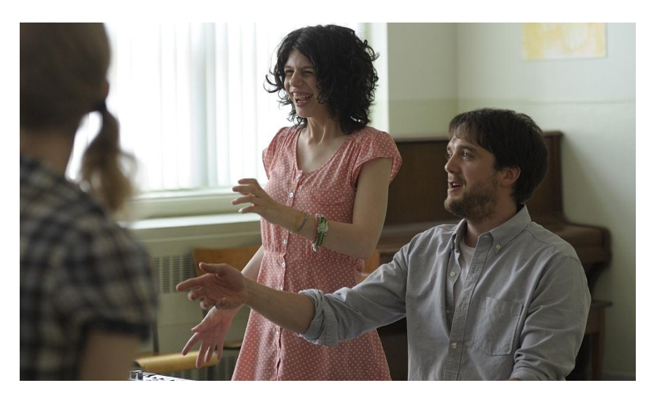
Land: Canada – Jaar: 2013 – Genre: drama – Speelduur: 104 min. Releasedatum: 31 oktober 2013 Distributie: Cinéart

GABRIELLE won de publieksprijs op het Filmfestival van Locarno 2013 en de publieksprijs op het Filmfestival van Namen 2013. De film was tevens de openingsfilm van Film by the Sea 2013 en geselecteerd voor het Filmfestival van Toronto 2013.